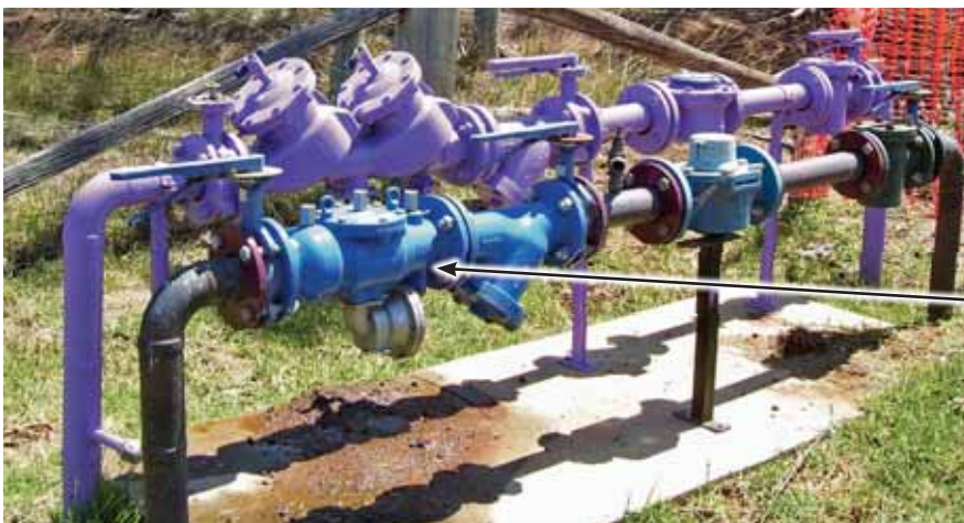
Example 1: High Risk Reduced Pressure Zone Device

Your accredited plumber will advise of any additional backflow devices required to protect the drinking water supply within your property.