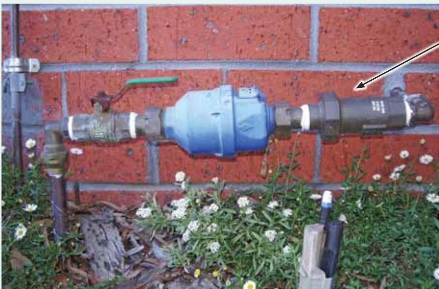
Dual Check Valve (non testable)